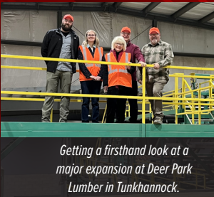
Getting a firsthand look at a major expansion at Deer Park Lumber in Tunkhannock.