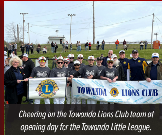
Cheering on the Towanda Lions Club team at opening day for the Towanda Little League.