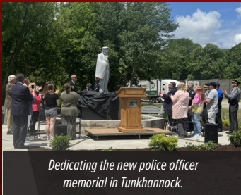
Dedicating the new police officer memorial in Tunkhannock.