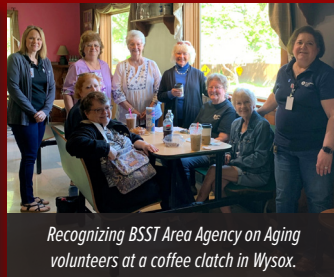
Recognizing BSST Area Agency on Aging volunteers at a coffee clatch in Wysox.